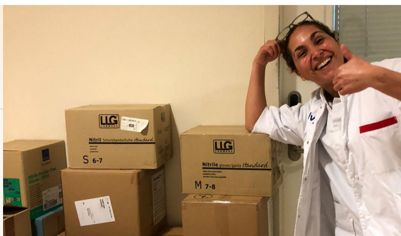
Several departments in the Faculty have donated lab coats, protective glasses and gloves to a hospital in Amsterdam and The Netherlands Red Cross.